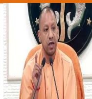
Mahanth Yogi Aditya Nath Ji Maharaj Manager/ Secretary Digvijai Nath Post Graduate College, Gorakhpur, UP