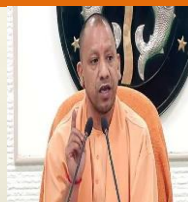
Mahanth Yogi Aditya Nath Ji Maharaj Manager/ Secretary Digvijai Nath Post Graduate College, Gorakhpur, UP